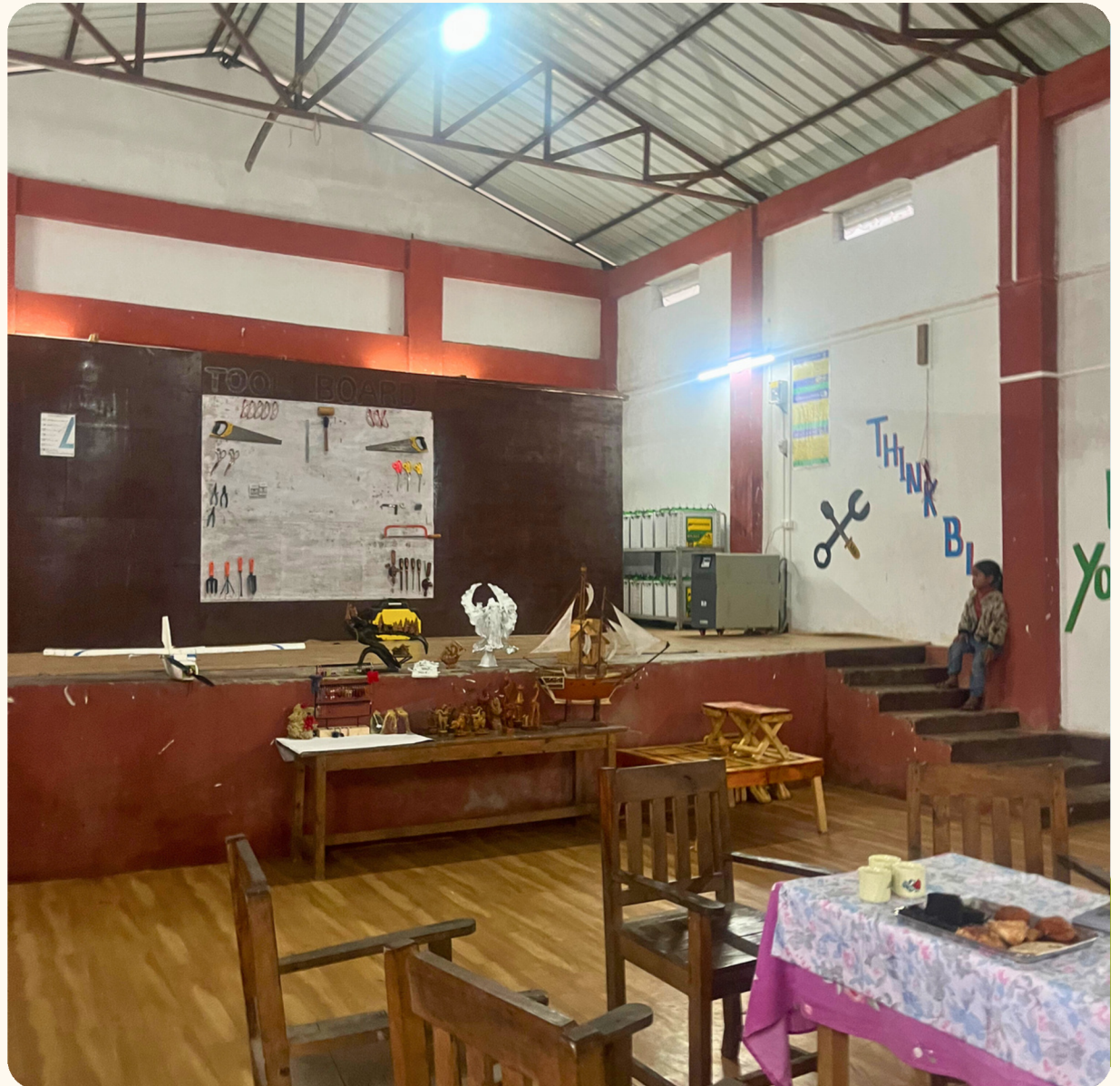
Khasi Hills, Meghalaya