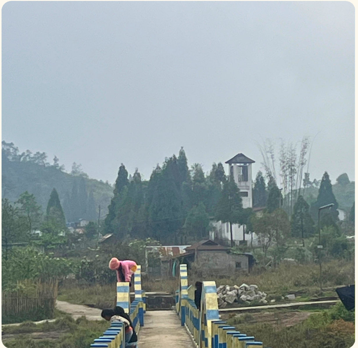
Khasi Hills, Meghalaya