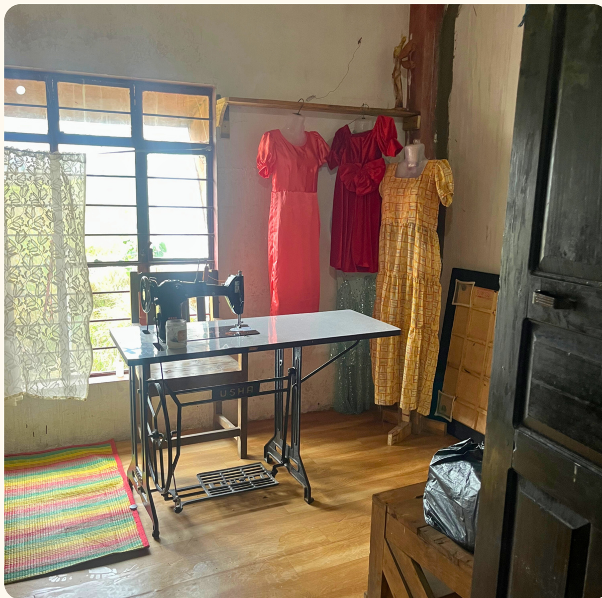
Khasi Hills, Meghalaya