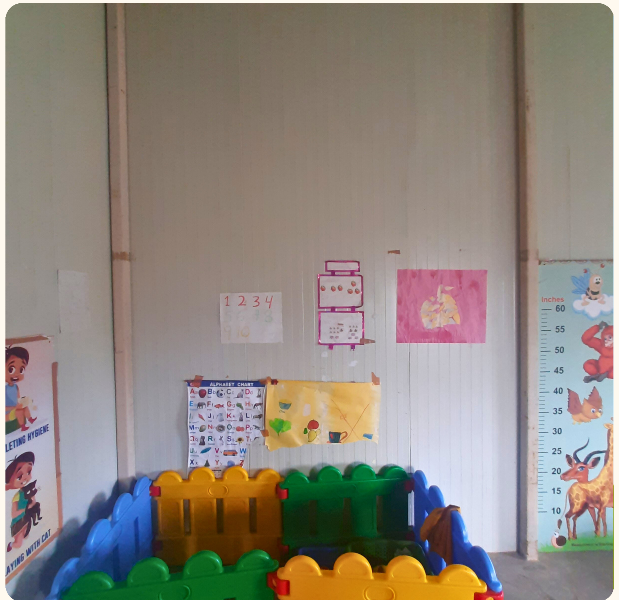
Jaintia Hills, Meghalaya