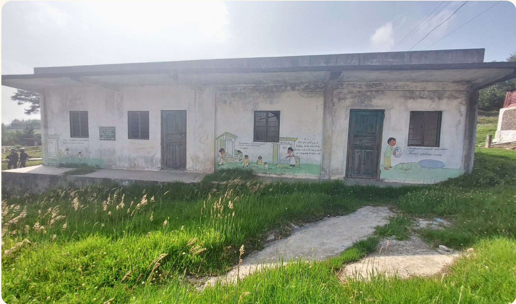
Khasi Hills, Meghalaya