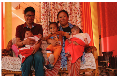
The Healthy Hearts