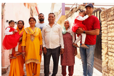
The Architects of Love