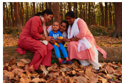
The Active Bloomers

Uncover and experience each family's unique journey, where responsive caregiving in talk, care, and play come alive in everyday moments.