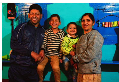
The Creative Educators