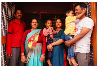
The Dreaming Drivers