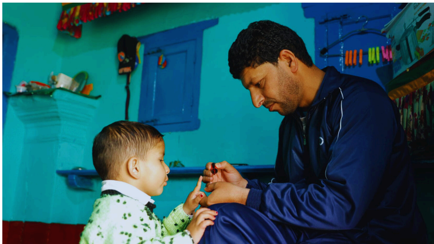
Figure 1: Father painting child's nail

The early years of a child's life are crucial for their development, and the way families respond during this time can make a big difference. Responsive caregiving is about being in tune with a child's needs—whether it's through their facial expressions, body language, or sounds—and responding in a way that makes them feel heard and supported. For example, in one of our photographs, a father paints his child's nails during play. This moment beautifully illustrates how attentively participating in a child's imaginative world strengthens their bond and nurtures the child's creativity and confidence.