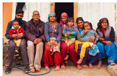
The Naturally Playful